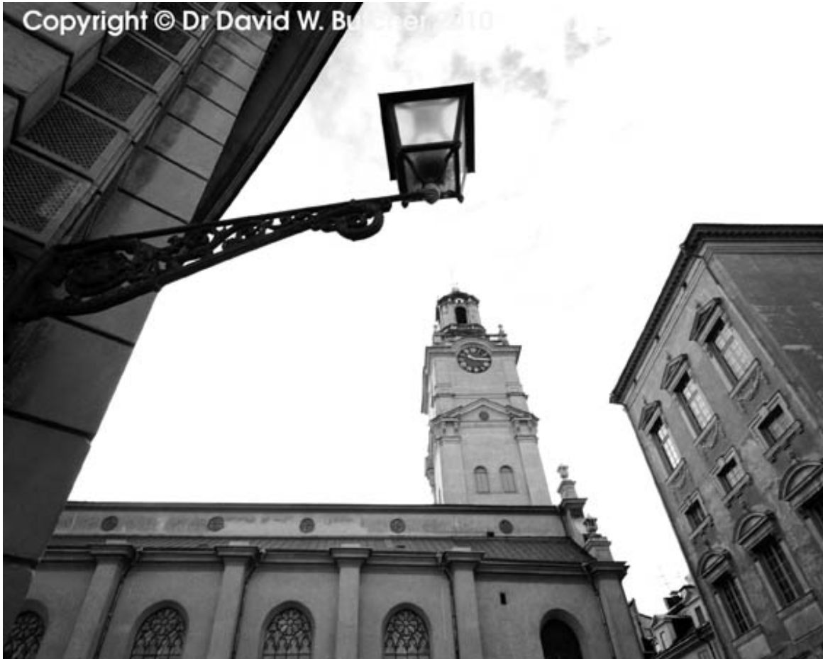
A view around the back of the Royal Palace in Stockholm with Storkyrkan in the background.