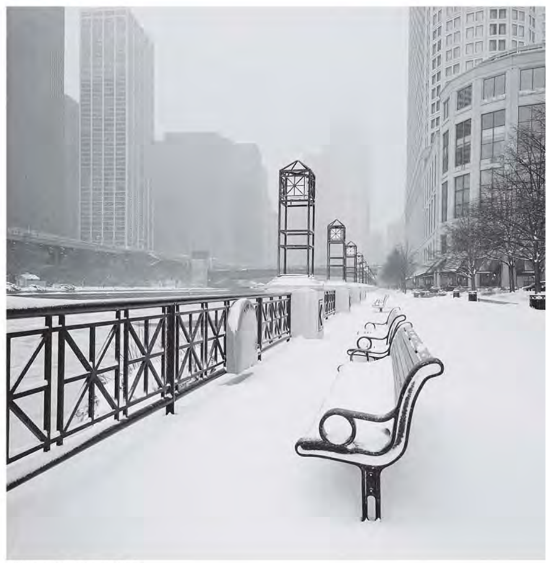
102. Chicago River Promenade in Snow