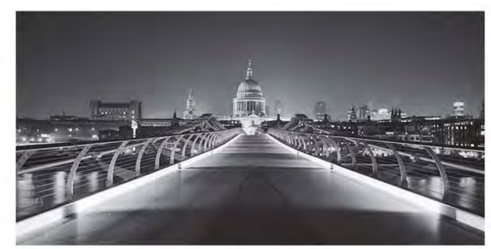
29.St Paul's from Millennium Bridge a