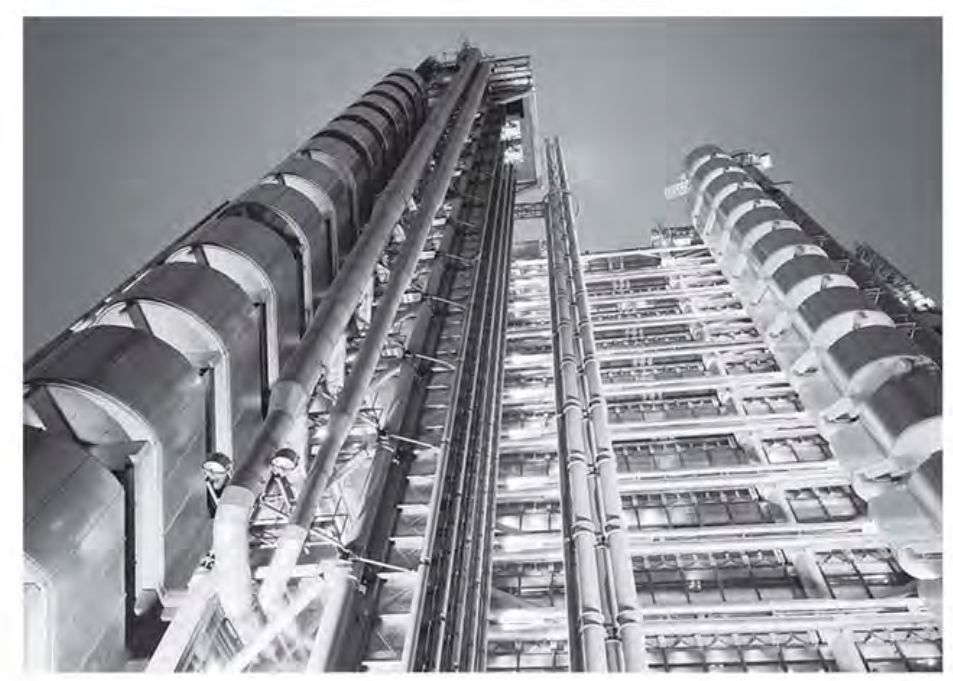
30. Lloyds Building a