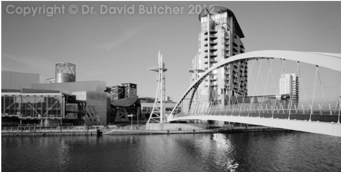
Salford Quays Victoria Building and Mariners Canal